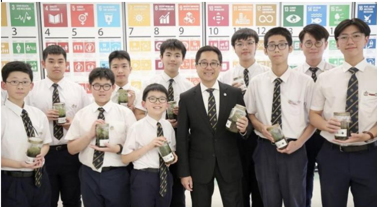
INTERVIEW BY AM730 (JUNE 2023)