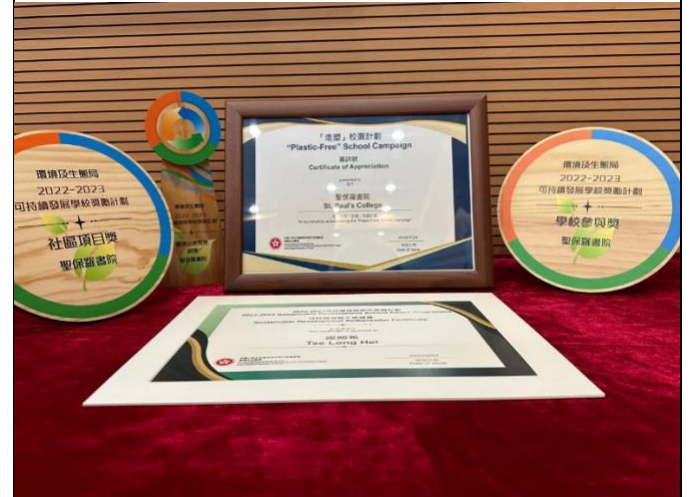
PRIZES PRESENTED BY EEB FOR 2022-2023